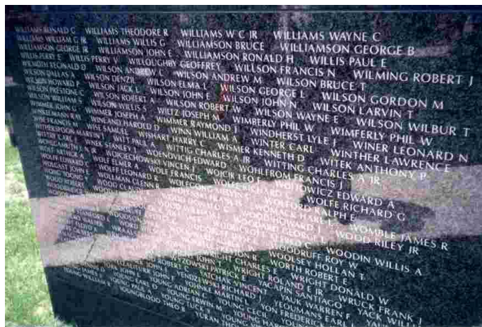
TYPICAL STONE PLAQUE U.S. SECTION PREFECTION OF OKINAWA, JAPAN MONUMENT