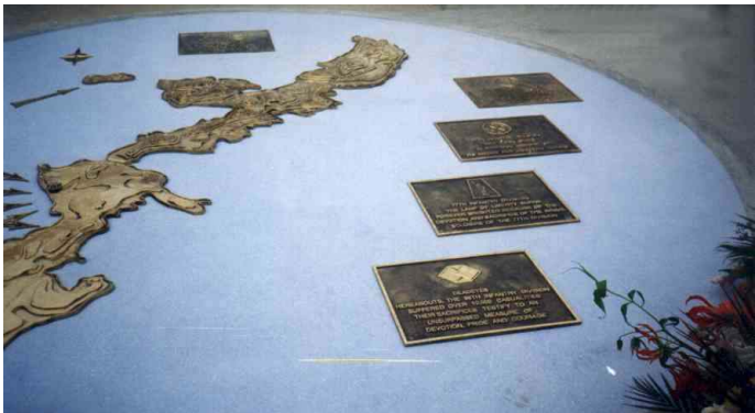
U.S. ARMY OKINAWA BATTLE MONUMENT TORII STATION, OKINAWA DEDICATED JUNE 21, 1995