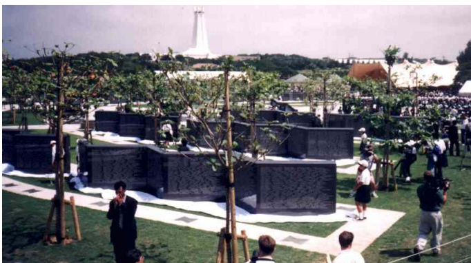
PREFECTURE OF OKINAWA BATTLE MONUMENT "CORNERSTONE OF PEACE" DEDICATED JUNE 23, 1995 U.S. SECTION WITH 14,005 NAMES OF DEAD