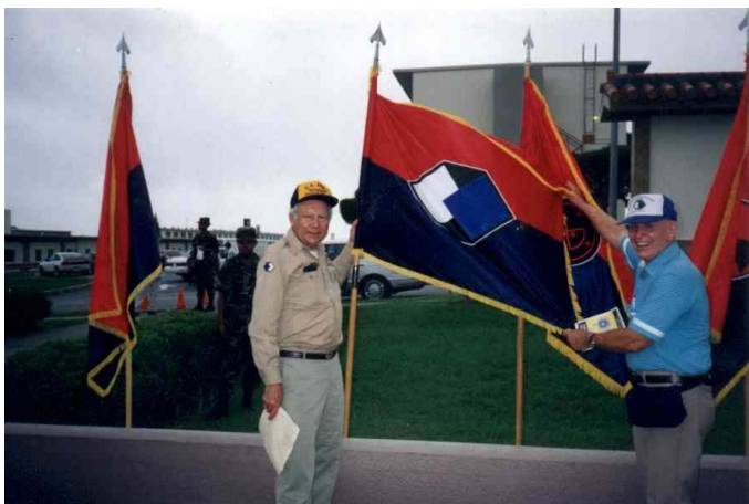
96TH INFANTRY DIVISION FLAG U.S. ARMY OKINAWA BATTLE MONUMENT DEDICATION